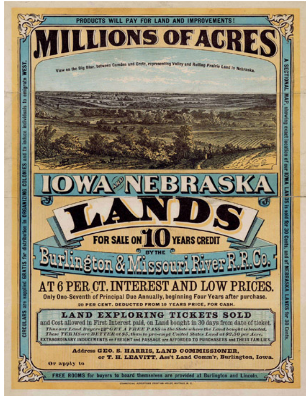
Primary Source 1: